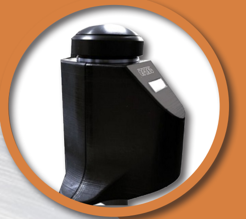
ePortaRock L 5 kgf load capacity