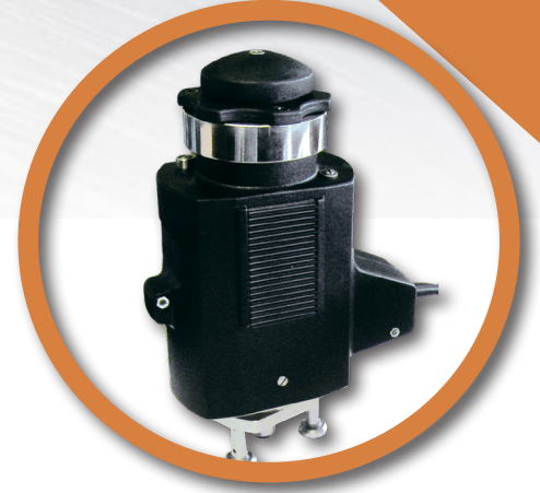
ePortaRock H 100 kgf load capacity