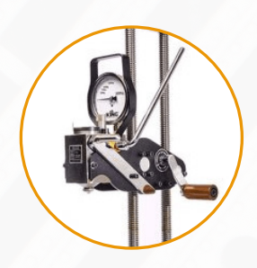
KING Portable Brinell Testers are versatile enough to test any size and shape of metal.

KING Tester applies up to a 3,000 kgf load on a10mm ball, making a lasting impression, which is available for re-reading at any time.