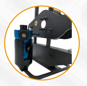
KING Tester Bases allow testing of your tallest and widest metal pieces.

Chain Adapter for testing an unlimited range of differently sized parts. Comes with 4' of chain. Longer lengths available.