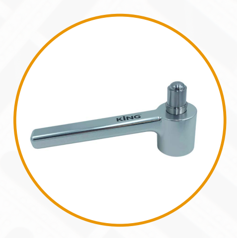
King Pin Tester™